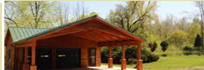
Bradner Covered Shelter

644 Bierley Ave. , Pemberville 2 Enclosed Shelters: 9:00 am - dark Occupancy: 78, Rental fee: $40, no heat or A/C, no water in winter, electric available - 20 amp Open Shelter: 92, non-reservable, 12 picnic tables