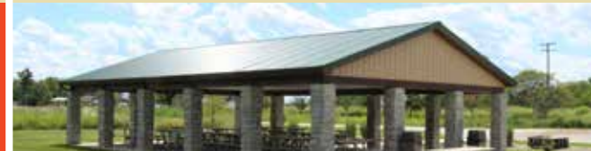
Cedar Creeks Preserve Open Shelter

Bradner Preserve 11491 Fostoria Road/SR 23, Bradner Enclosed Shelter: 9:00 am - dark Occupancy: 54, Rental fee: $40 electric available, no heat or A/C, 8 picnic tables