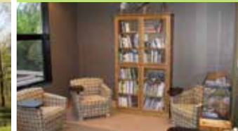
W.W. Knight Library

W.W. Knight William & Elsie Knight Library 8:00 am - 8:00 pm site limit: 8 people