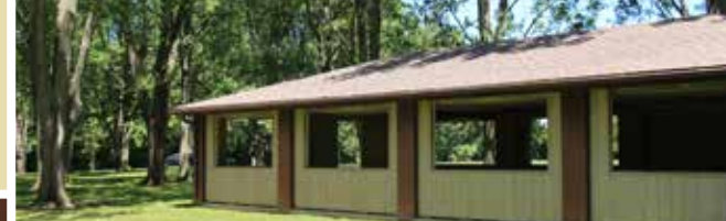
William Henry Harrison Park Riverview Shelter

644 Bierley Ave. , Pemberville 2 Enclosed Shelters: 9:00 am - dark Occupancy: 78, Rental fee: $40, no heat or A/C, no water in winter, electric available - 20 amp Open Shelter: 92, non-reservable, 12 picnic tables