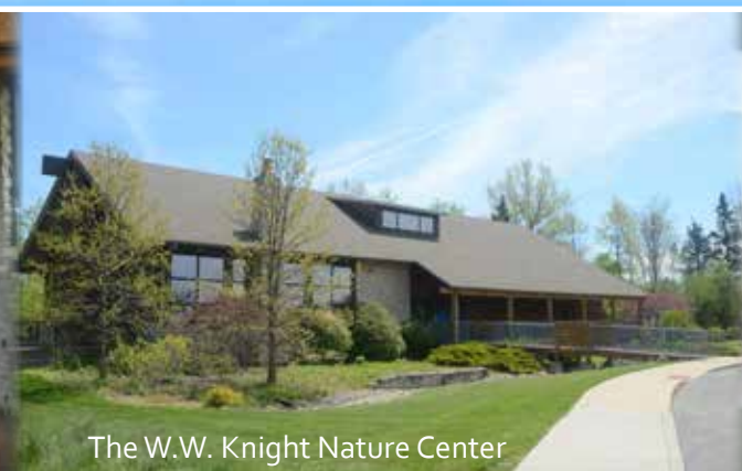
The W.W. Knight Nature Center