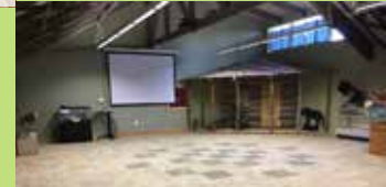
Friends' Green Room

W.W. Knight Friends' Green Room 9:00 am - 10:00 pm projector screen site limit: 30 people